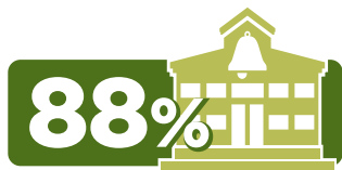
Increased confidence to support their child's education*