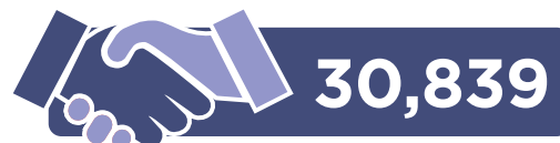
Hours of family engagement opportunities

*For respondents with greatest demonstrated need in the pre-survey