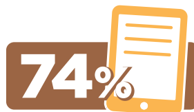
Increased confidence in technology skills*